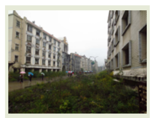
Chinese tourists make their way through the preserved ruins of "Old Beichuan."

Beichuan, a town built in some ways in place of Old Beichuan, but also as accommodations for disaster tourists visiting the area. The vast majority of businesses in this town built in grandiose reference to the styles of Qiang architecture consisted of hotels, restaurants, and gift shops. To many of us, it seemed somewhat fantastic; it was not the modernist (however poorly constructed), functional, administrative apparatus that was Old Beichuan,