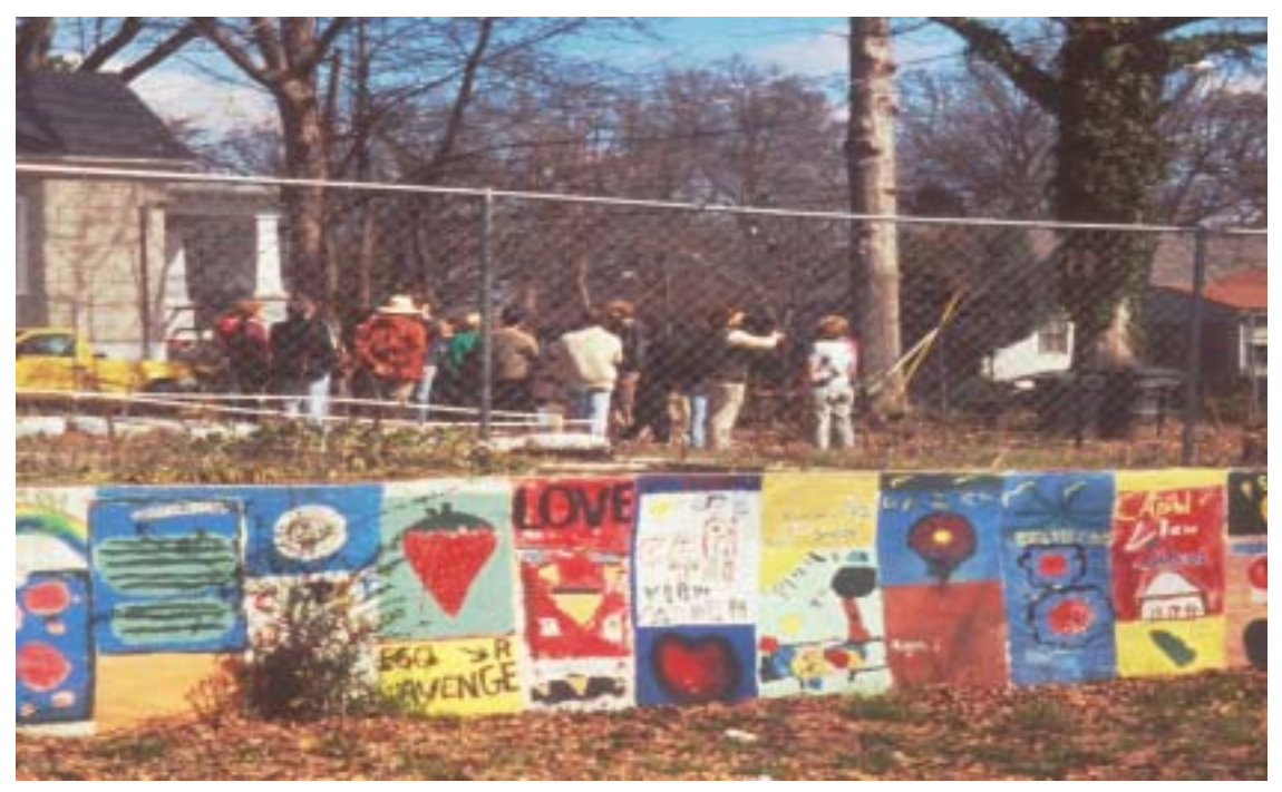
SfAA members tour the Capitol View Community Garden, one of several stops on a tour of Atlanta's urban agriculture during the 2002 SfAA conference. Todd Crane of UGA organized the tour as an activity of the SfAA Food and Agriculture Interest Group. A food and agriculture related tour is planned for the 2003 SfAA conference in Portland.

Rim countries. Tour sites will include a marine cargo facility that handles imports and exports of food from/ to global markets, and regional food centers that process and distribute food to feed a large urban and regional population. "Big" is the theme as the tour examines several mega-features of our food system.