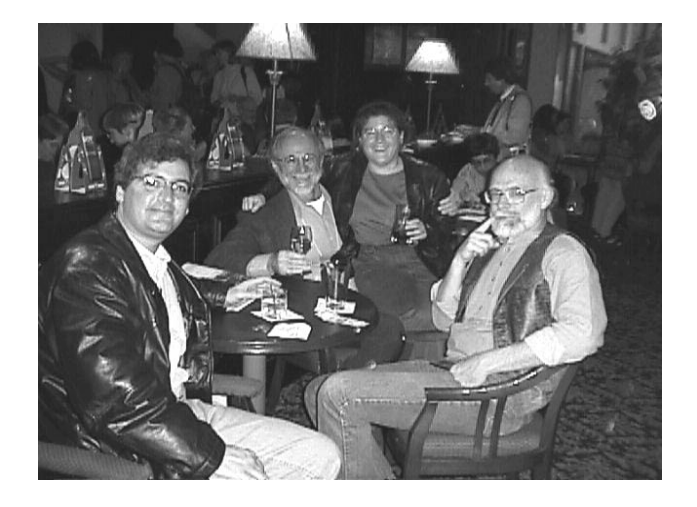
University of Iowa Anthropologists at SF Meetings

New program guidelines were also announced by Smithsonian Fellowships in Museum Practice (FMP). Proposals are invited from scholars and practitioners to write manuscripts suitable for publication on issues of importance to the museum field. One fellowship is awarded annually for a period of up to 6 months. An award consists of a $3,000 per month stipend, round-trip travel expenses and $1,000 for manuscript preparation. Application deadline is February 15, 2001. For further information and application requirements, see: <www.si.edu/cms/fmp.htm> or contact the program manager via e-mail: <fmp@scems.si.edu>, Fax: 202-357-3346, or mail: Fellowships in Museum Practice, SCEMS Smithsonian Institution, Washington, D.C. 20560-0427.