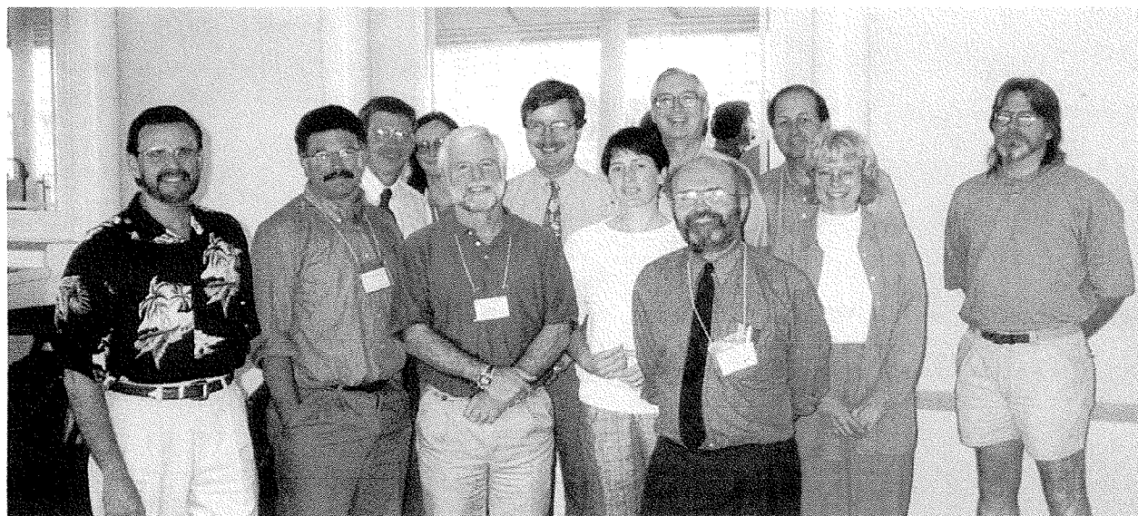
Executive Board Members – 1998 SfAA Meetings