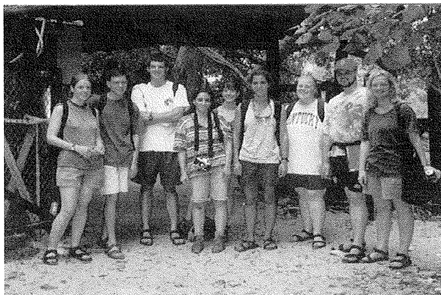
NCSU's Costa Rican Field School - 1998